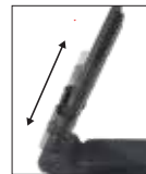
2. Adjust shelf up or down