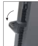
3. Flip shelf down to lock in place