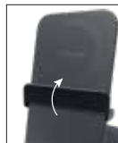
1. Flip shelf to up position